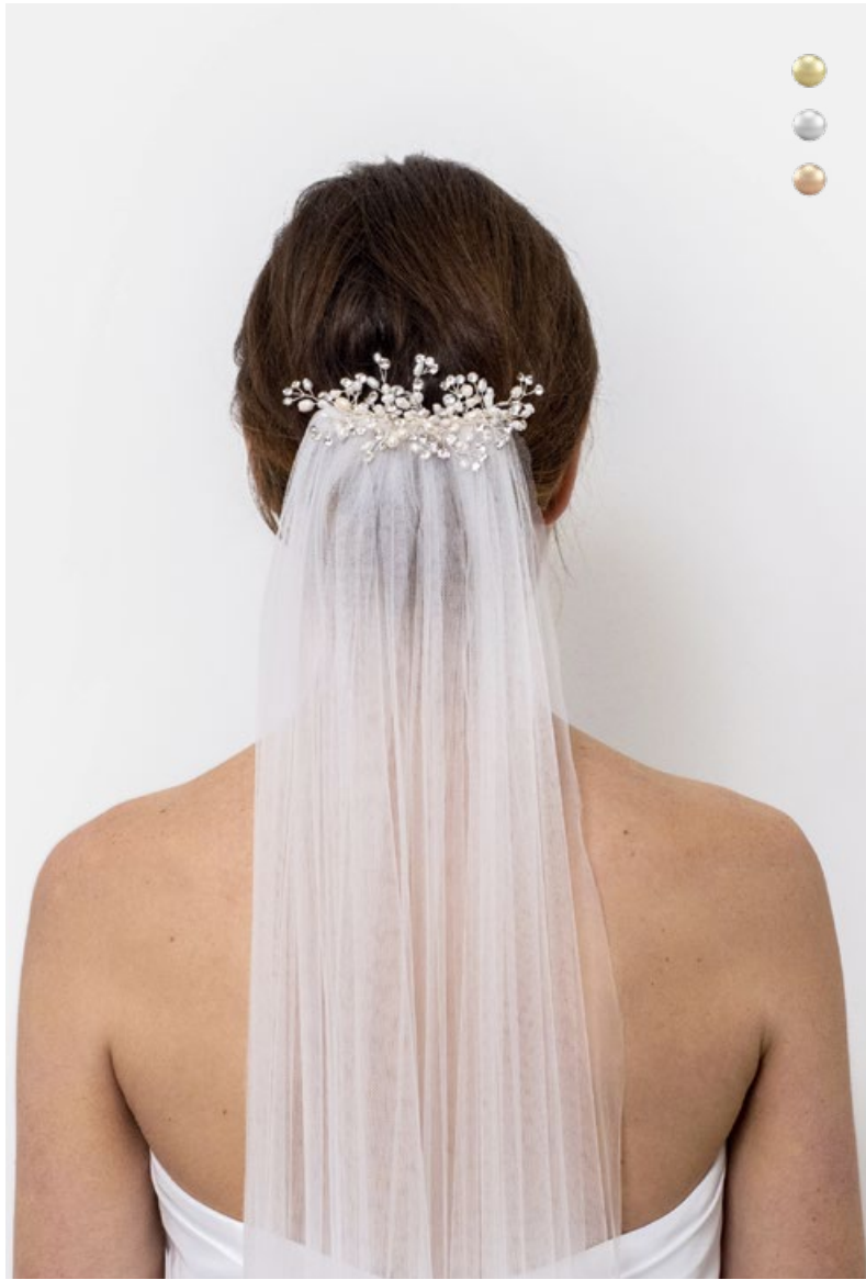
ROWIE VEIL – SL-FWP available in: 220cm