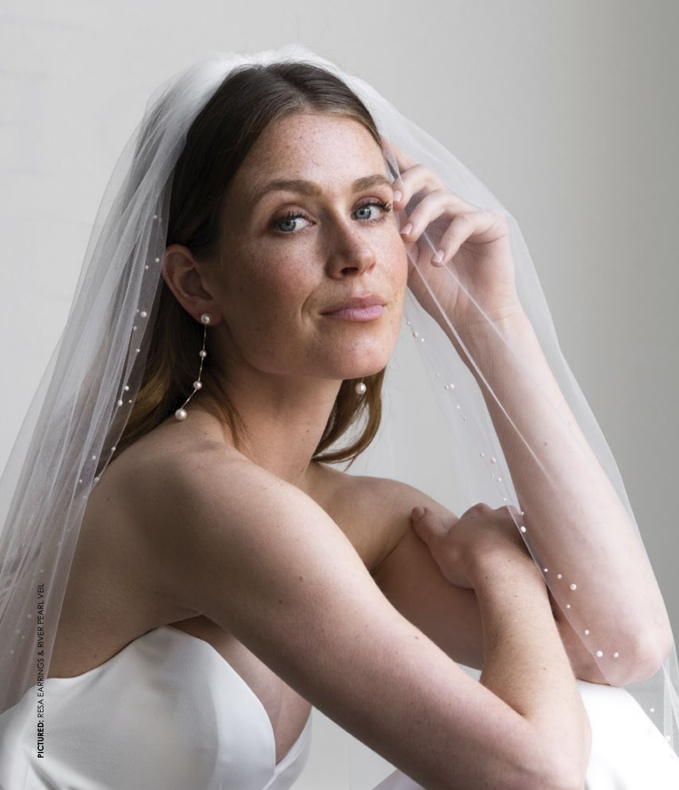
PICTURED: RESA EARRINGS & RIVER PEARL VEIL