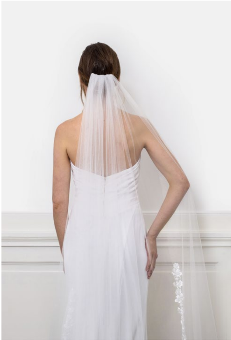
ROSA VEIL – SL-KT-IVORY available in: 260cm & 300cm