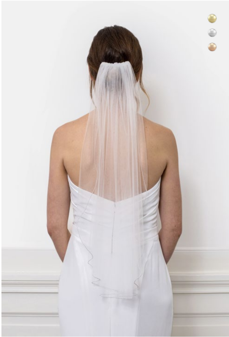
RUBY VEIL – SL-BC available in: 70cm, 110cm, 220cm & 260cm