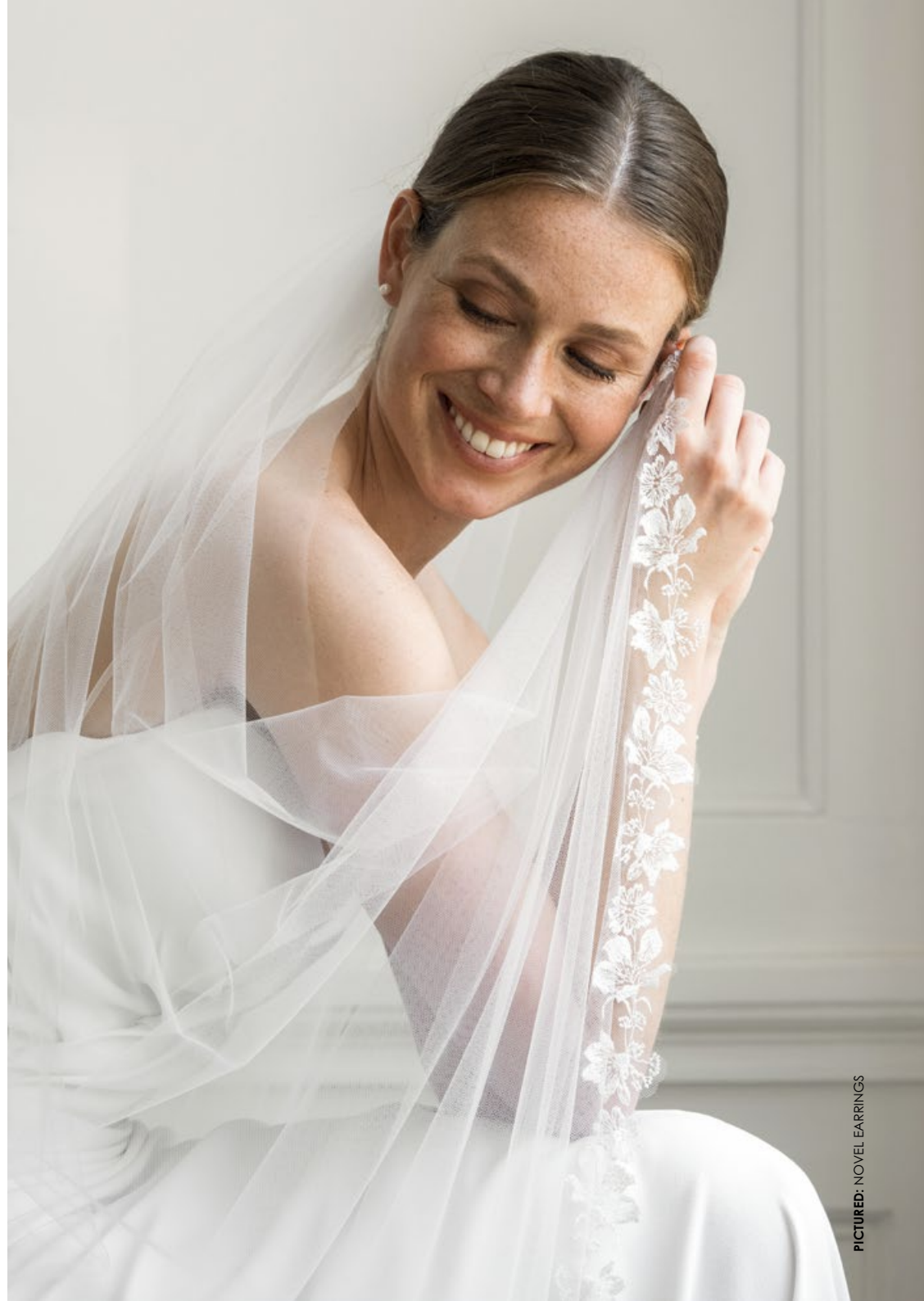
PICTURED: NOVEL EARRINGS