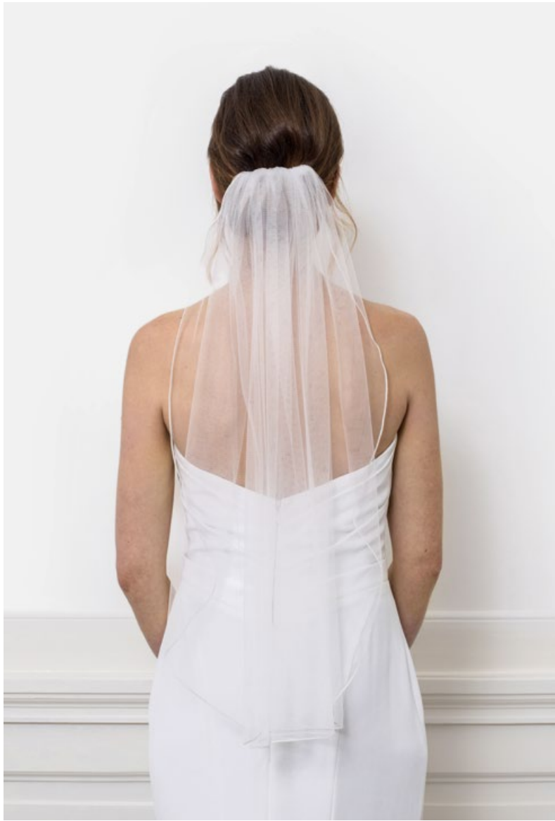
ROX VEIL – SL-LK available in: 70cm, 110cm, 220cm, 260cm & 300cm color combinations: ivory-silver, ivory-gold, cream-gold & rose-silver