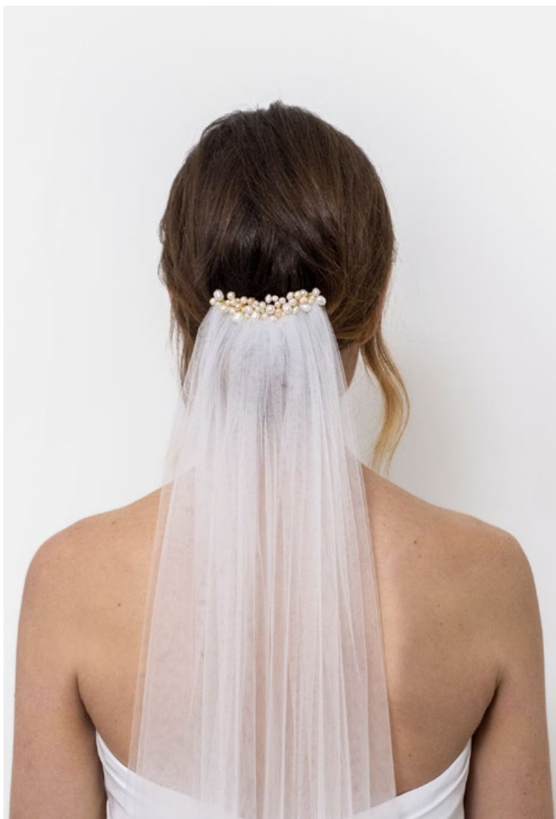
ROZAN VEIL – SL-FMP-SILVER available in: 220cm