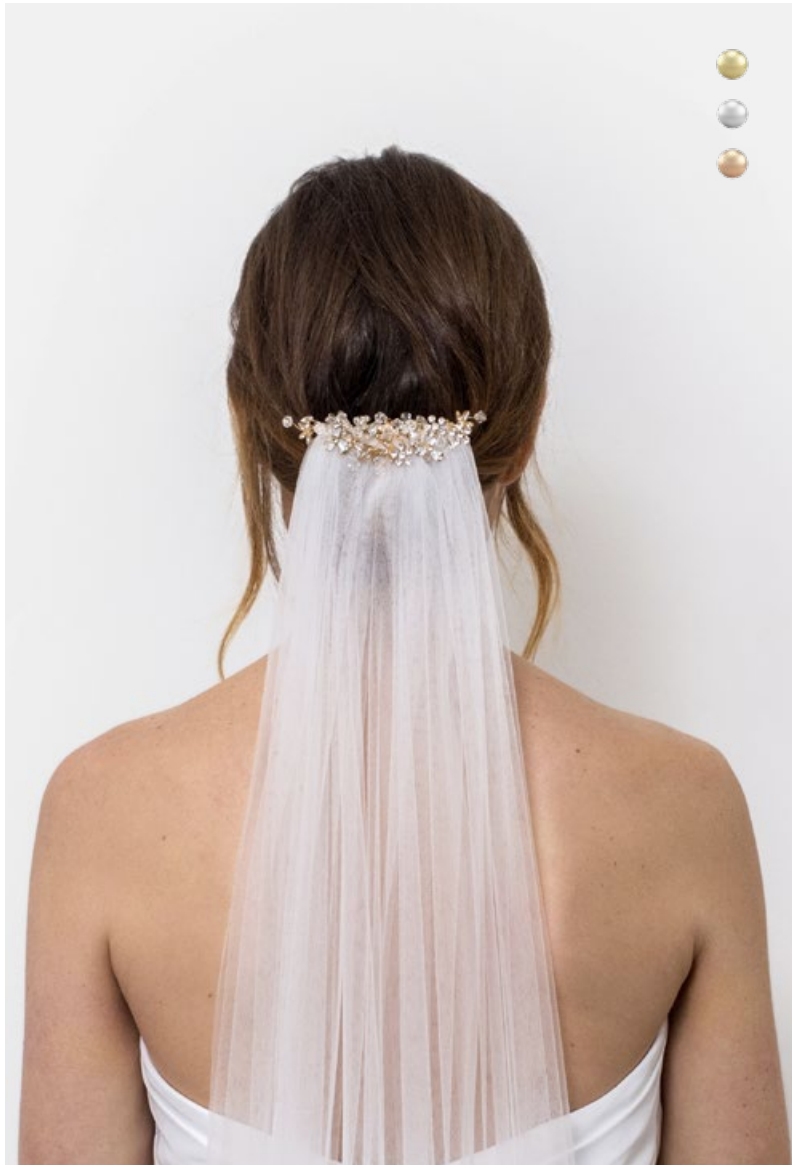
RUTH VEIL – SL-FLOWER available in: 220cm