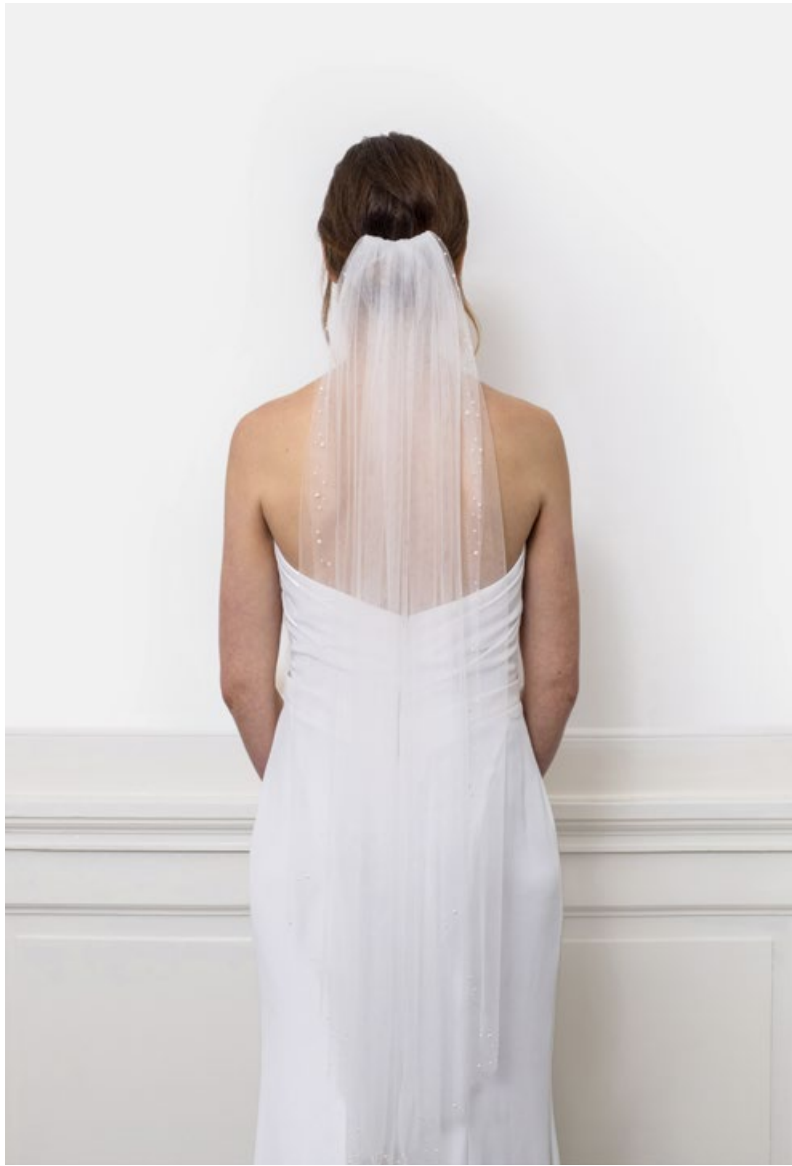
RIVER PEARL VEIL – SL-P available in: 70cm, 110cm, 220cm & 260cm