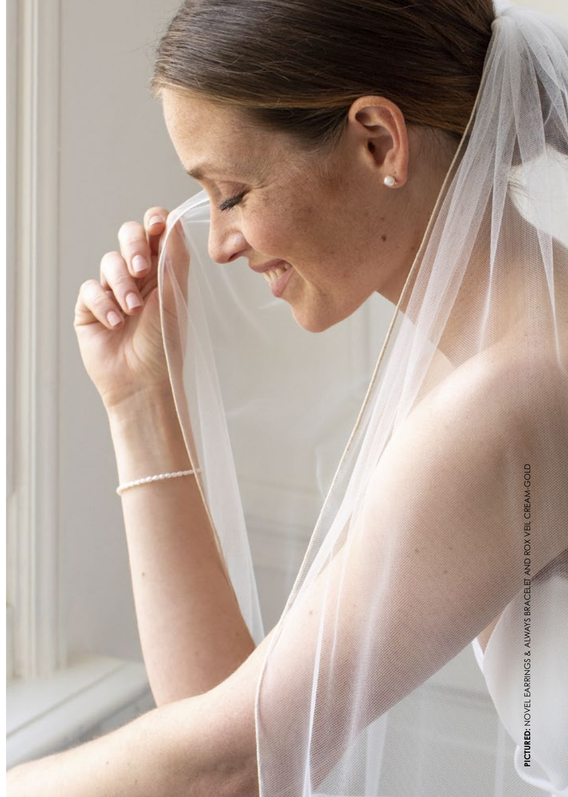
PICTURED: NOVEL EARRINGS & ALWAYS BRACELET AND ROX VEIL CREAM-GOLD