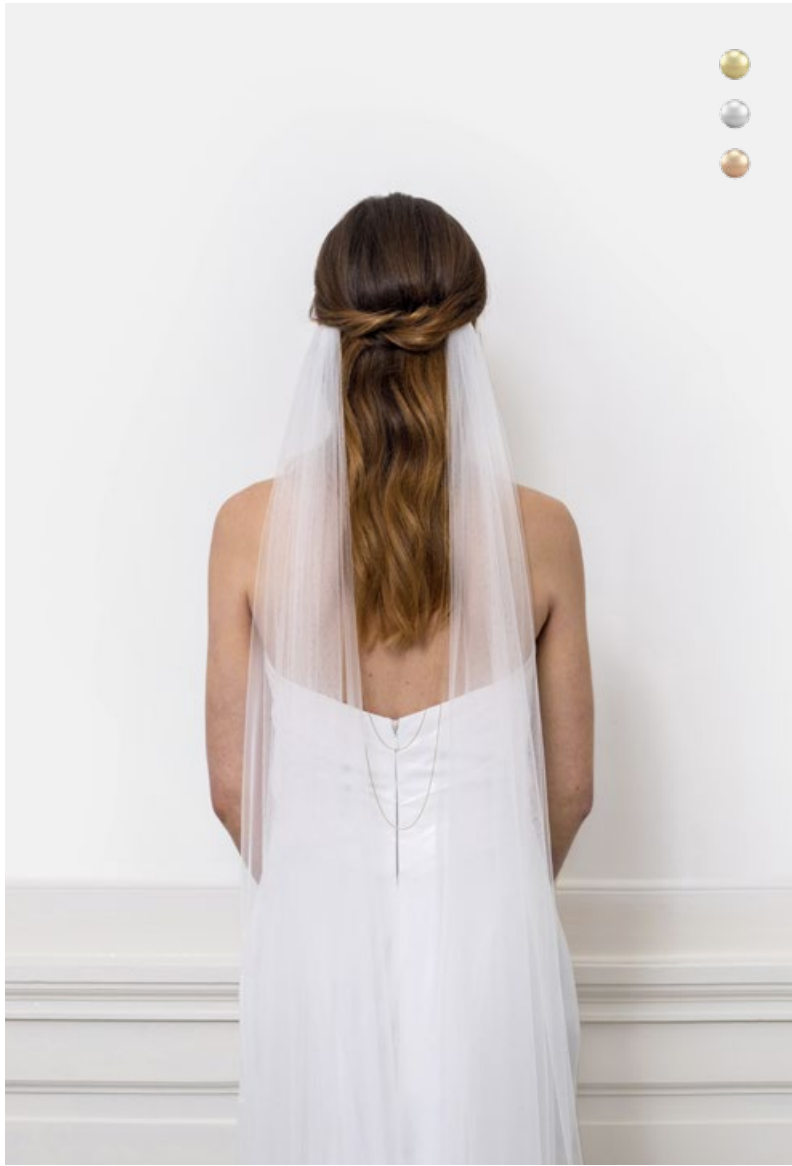
ROME VEIL – SL-DBC available in: 220cm