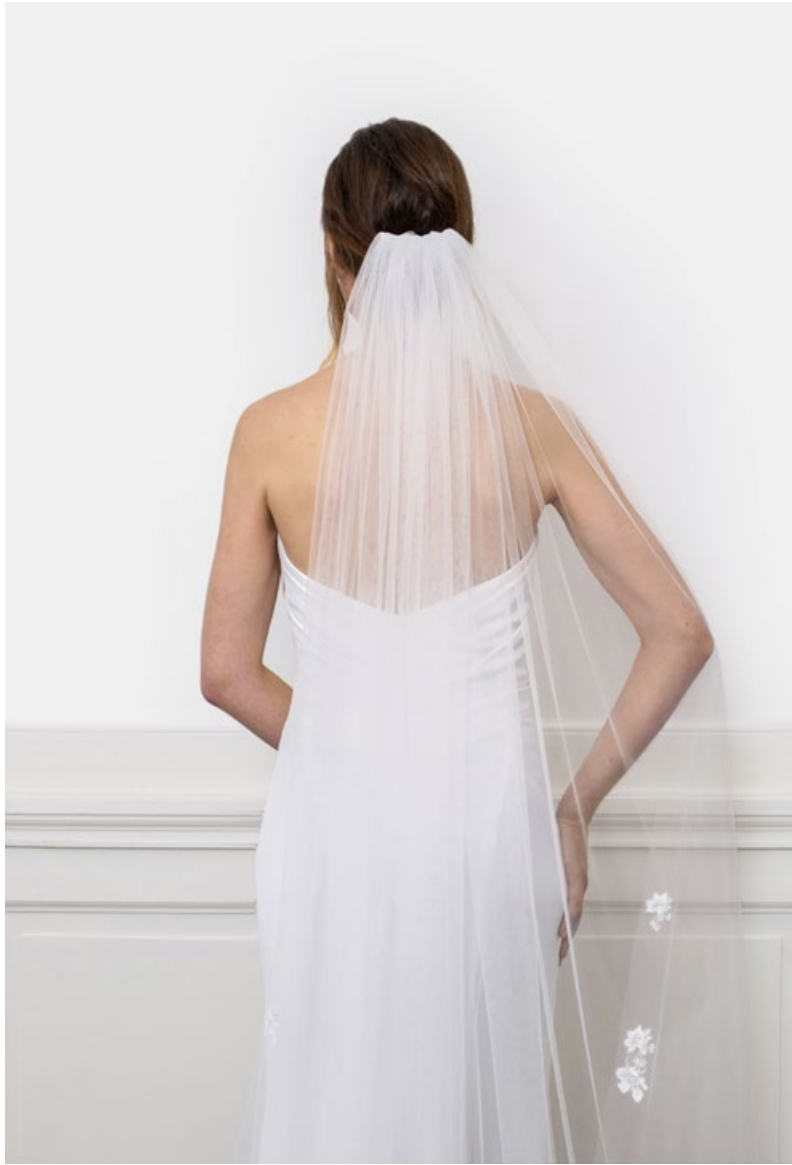
RIVA VEIL – SL-KTS-IVORY available in: 260cm & 300cm