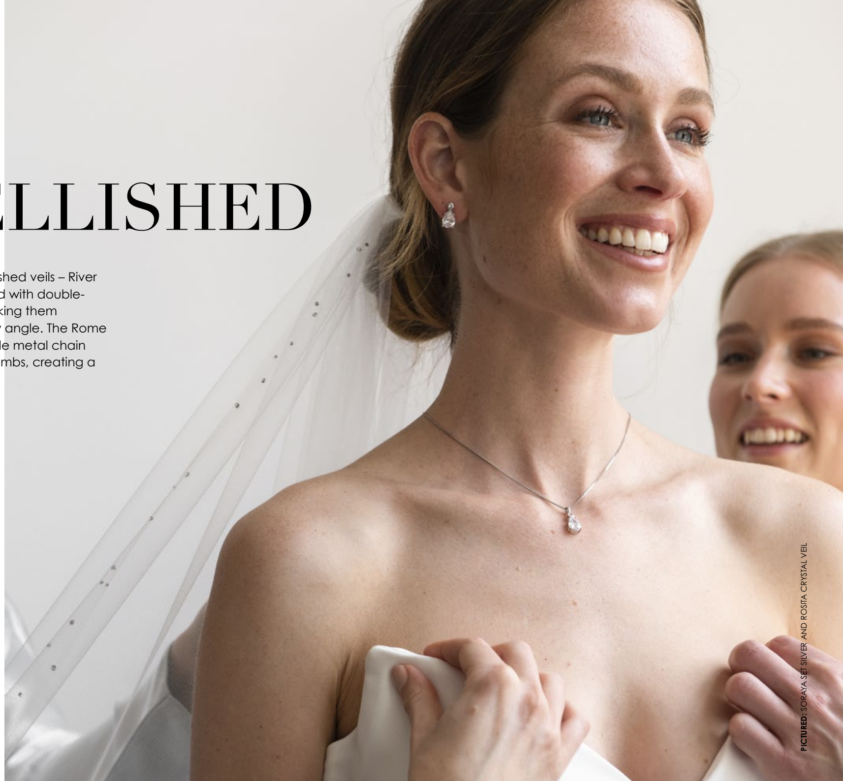
PICTURED: SORAYA SET SILVER AND ROSITA CRYSTAL VEIL

Our crystal and pearl embellished veils – River and Rosita – are hand-finished with double-sided pearls and crystals, making them absolutely perfect from every angle. The Rome veil is embellished with a subtle metal chain that hangs from its double combs, creating a Roman look.