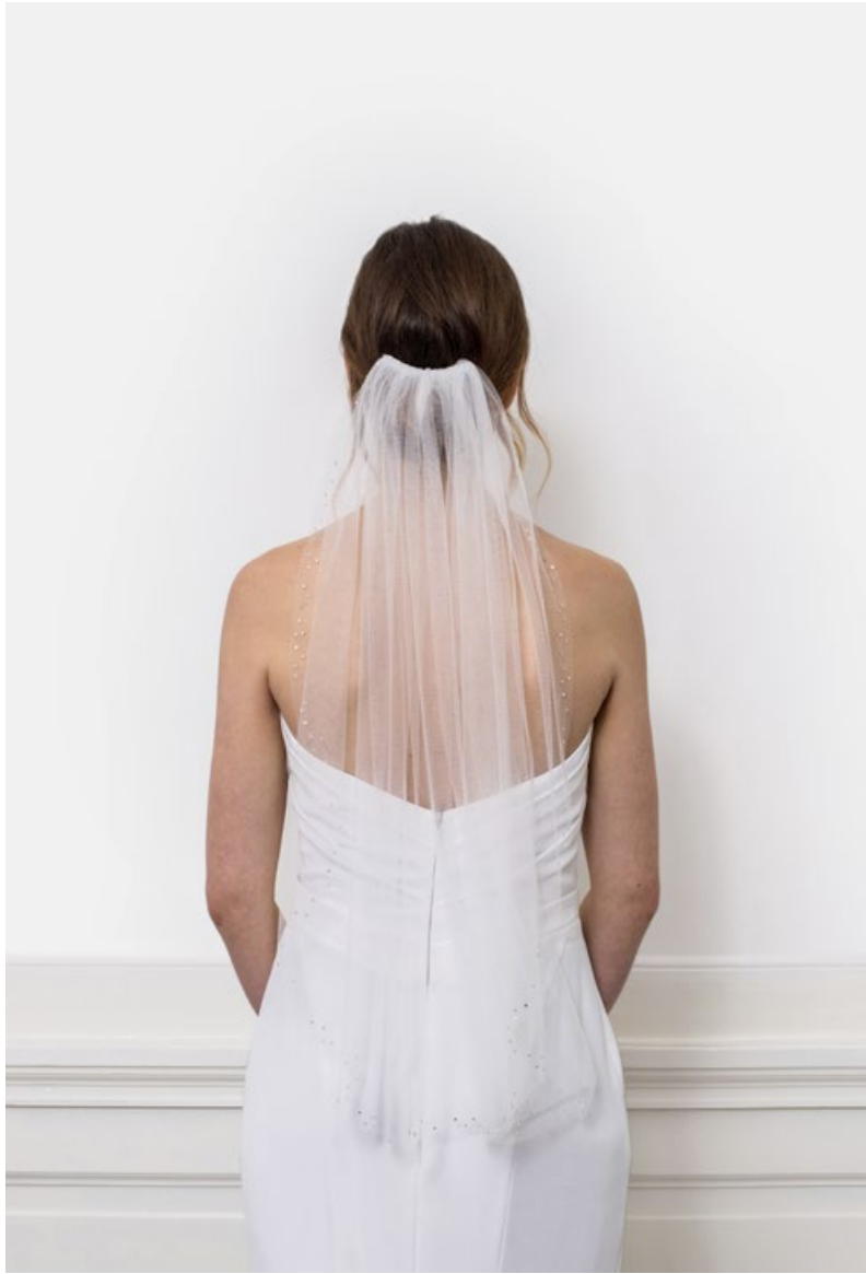
ROSITA CRYSTAL VEIL – SL-ST available in: 70cm, 110cm, 220cm & 260cm