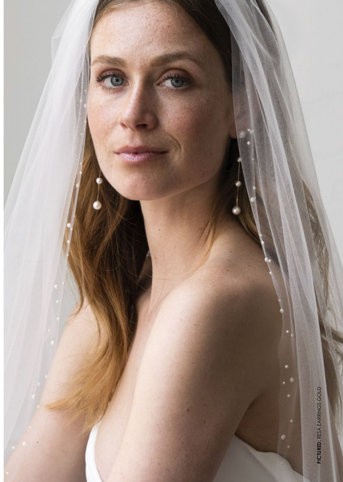
PICTURED: RESA EARRINGS GOLD